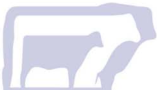
Figure 1 – Information used to calculate Trial Shear Force EBV M s